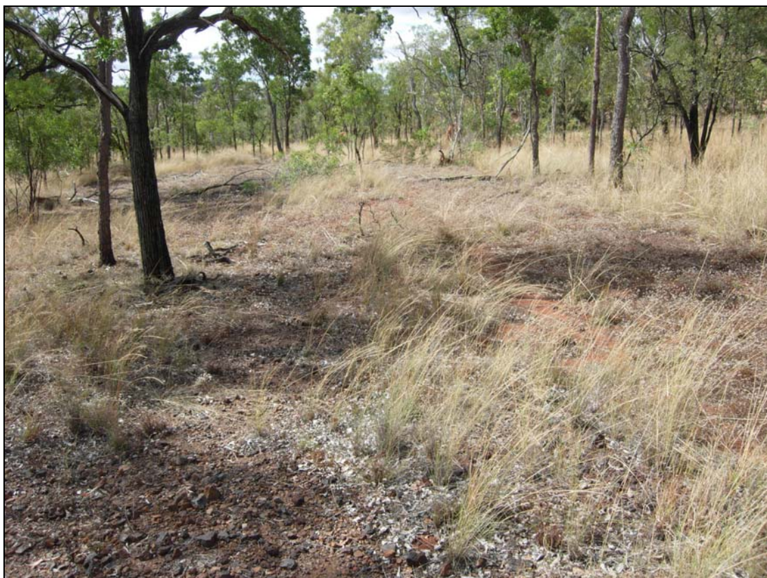
Plate 4: Area away from main outcrop at Mt Lucy where anomalous lead-zinc-silver samples previously collected