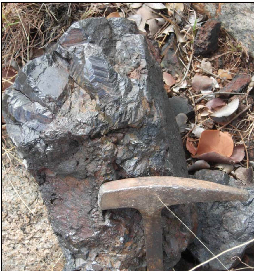
Plate 3: Detailed view of very coarse-grained magnetite crystals