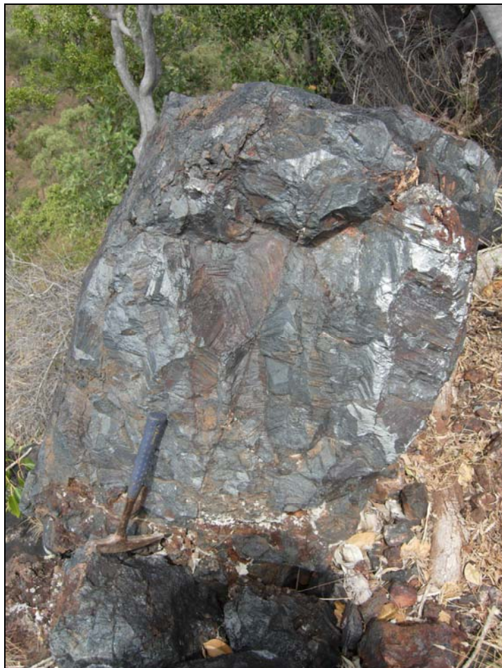
Plate 2: Massive magnetite crystals at Mt Lucy