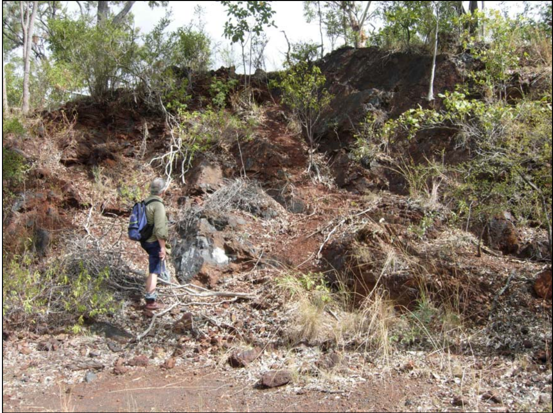
Plate 1: Small pit at Mt Lucy